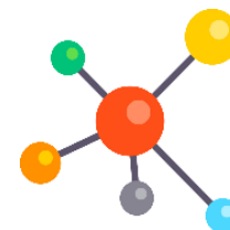
Diagram 1 [4; 46].